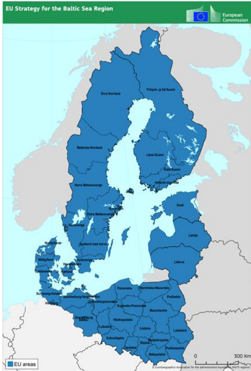
Annex 1: map of the EU Strategy for the Baltic Sea Region